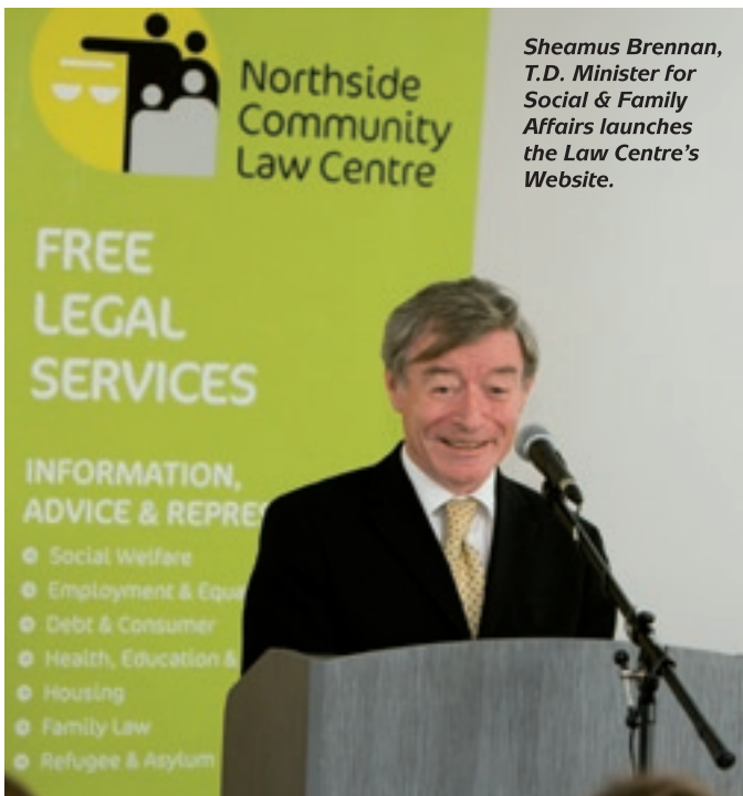
Sheamus Brennan, T.D. Minister for Social & Family Affairs launches the Law Centre's Website.